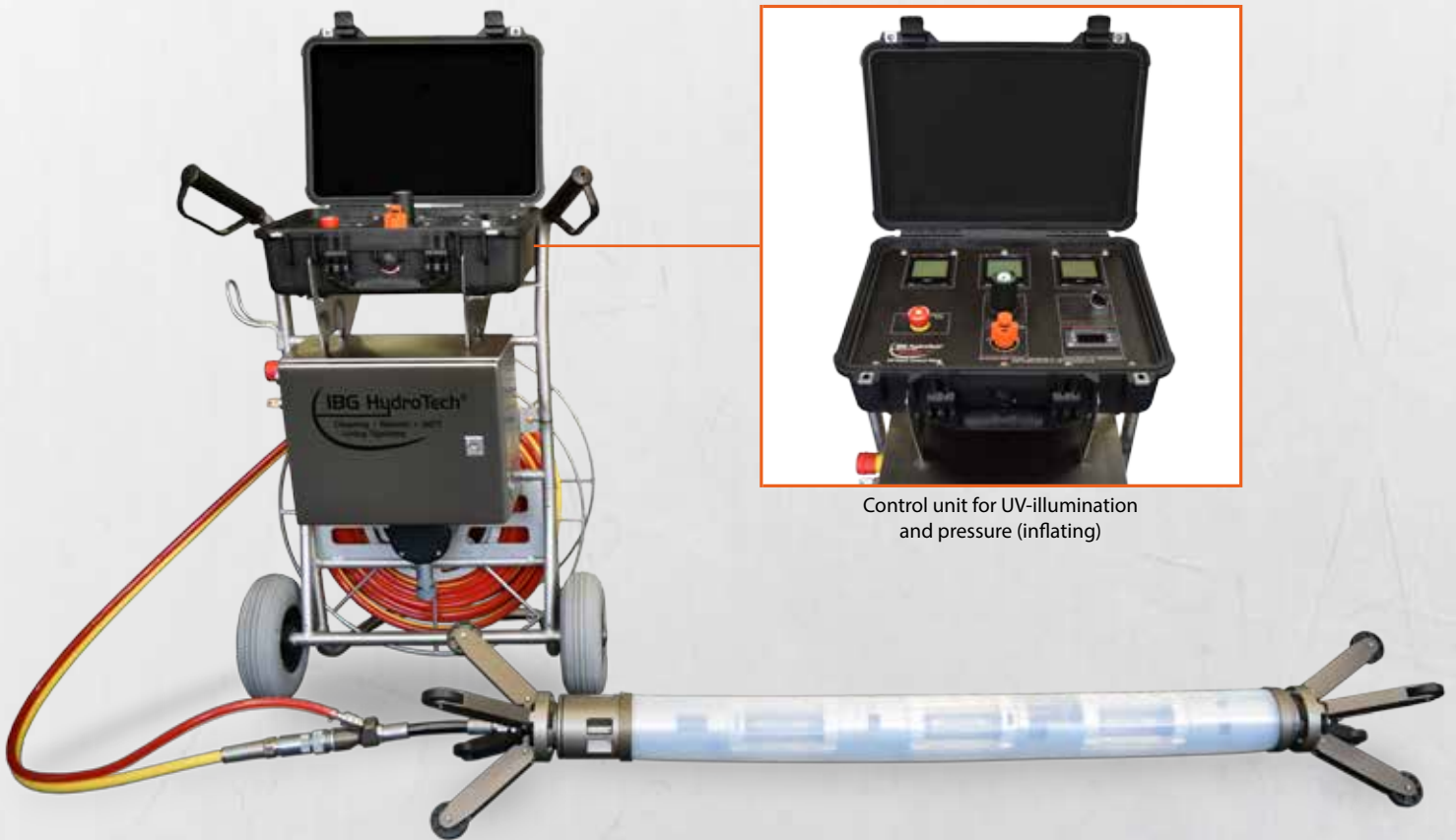
Control unit for UV-illumination and pressure (inflating)

The UV-Patch-System allows the rehabilitation of damaged pipe sections in lengths up to 1 meter (40")