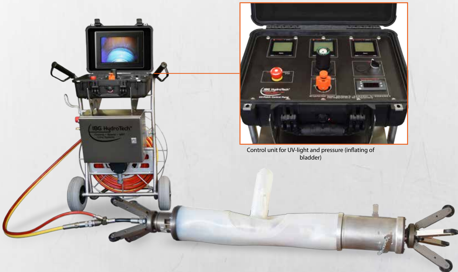
Control unit for UV-light and pressure (inflating of bladder)

The system allows the rehabilitation of lateral pipe connections